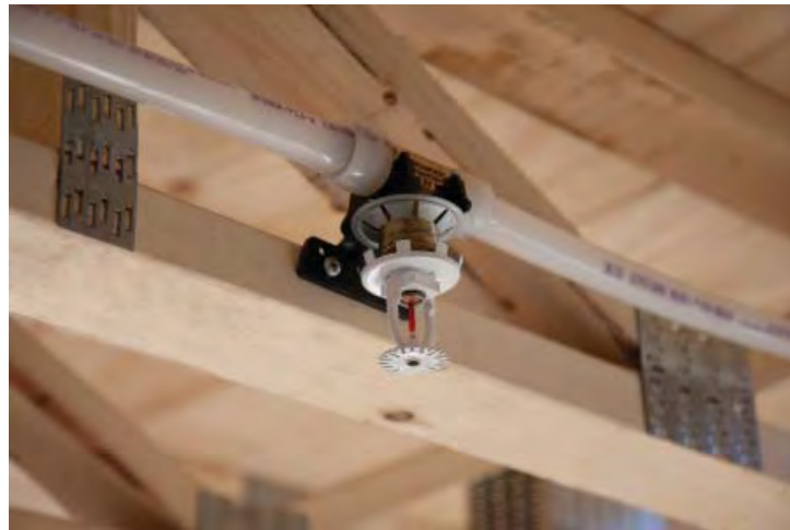
FIGURE 9-1 Residential sprinkler in multipurpose loop system using PEX tubing Courtesy of Uponor Inc.