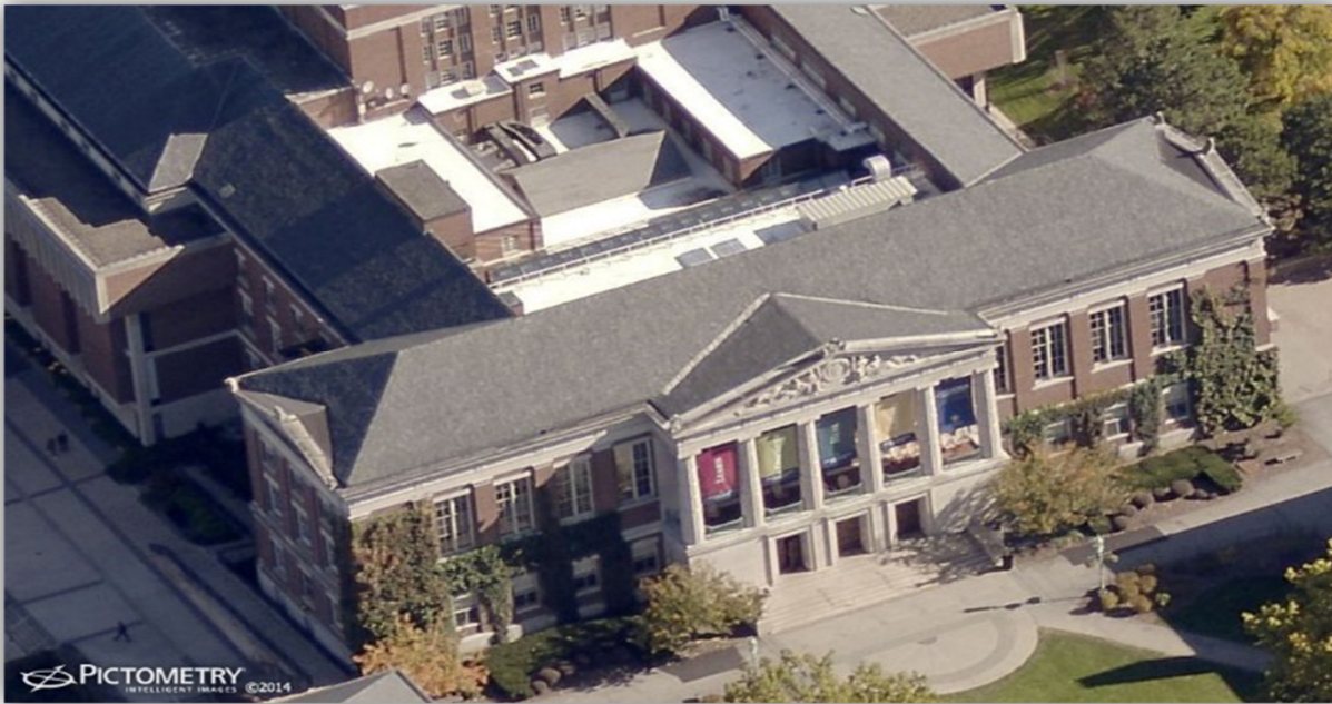
Example of 3" Neighborhood Imagery

This quote is non-binding, creates no legal rights, duties or obligations, expressed or implied, on either party, and shall become binding only in the event that Pictometry and Customer enter into a definitive agreement incorporating it. The pricing quoted above does not reflect applicable taxes, which will be reflected in any resulting definitive agreement with Customer. This quote is valid until the date shown above, after which it expires. All Discounts are approximate.